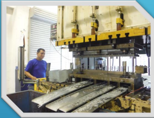
Progressive Pressing Process